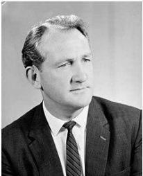
Uren in 1963.

At the Tom Uren AC Memorial Lecture held on 20 th June 2021 (which was hosted by The Hon Anthony Albanese MP and delivered by The Hon Linda Burney MP ); Mr. Albanese said about his friend: “He lived an incredible life. He witnessed the depravity and cruelty of war, but he never lost his humanity. Tom went on to be a minister in the Hawke Labor Government. He was an anti-war advocate. He was a strong anti-nuclear advocate. He fought to preserve Sydney Harbour. To me, Tom Uren was a father figure. He was my mentor. He was my friend. Tom Uren was a man driven by values derived from his own experiences. As a veteran, he abhorred violence. As a campaigner, he believed in a better Australia; and he believed Labor was the party to make that happen. His beliefs inspired me to strive to make this country fairer, better, more ambitious. Those values still drive me today.”