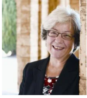
CARMEN LAWRENCE AO Former WA Premier and Professor Emerita