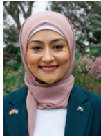
FATIMA PAYMAN Independent WA Senator