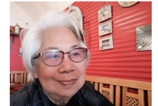
CORAZON FABROS Co-president of International Peace Bureau