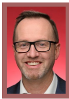
DAVID SHOEBRIDGE NSW Greens Senator and Former Barrister