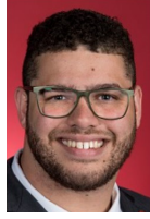
JORDAN STEELE-JOHN WA Greens Senator