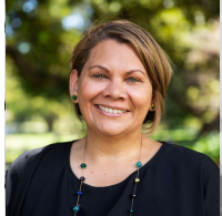
DORINDA COX WA Greens First Nations Senator