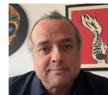
VIJAY PRASHAD Author, journalist, and historian