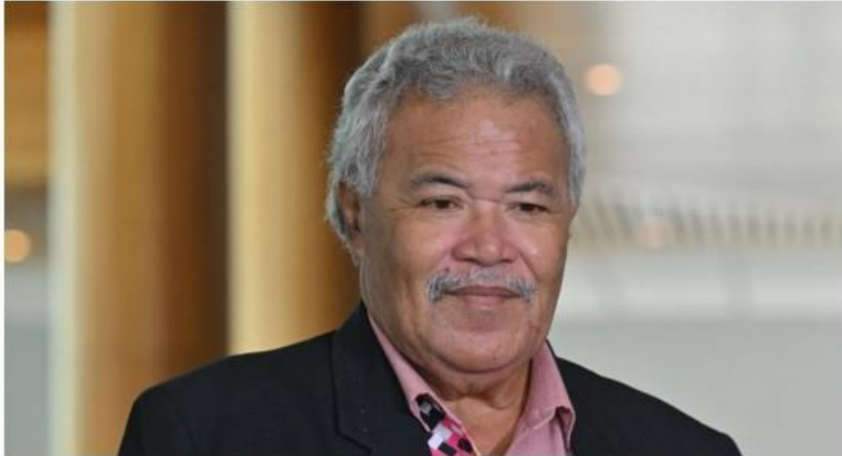
TUVALU'S FORMER PRIME MINISTER ENELE SOPOAGA