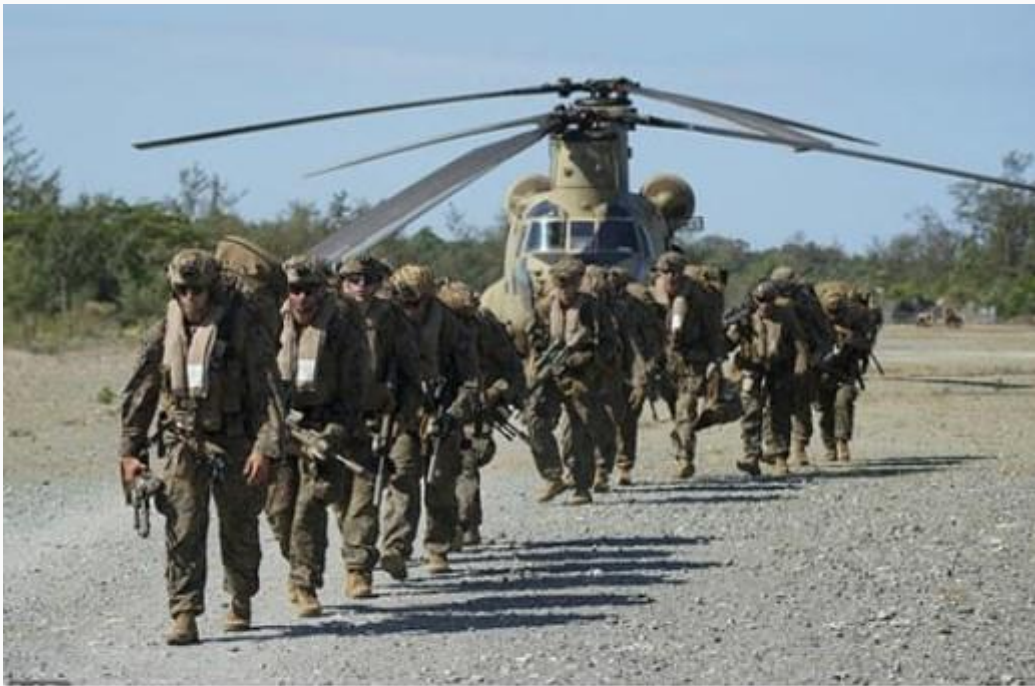
— In anticipation of a potential Chinese invasion of Taiwan, the US military has been carrying out ominous war games in the Philippines (pictured during a joint exercise with the Philippine military on May 6, 2024)

The developments are a disturbing glimpse into the perspective of US military leaders as the hostile nation continues to threaten to invade Taiwan. Any direct conflict between the US and China could easily spiral into World War Three, with both nations in possession of nuclear weapons that could destroy the planet.