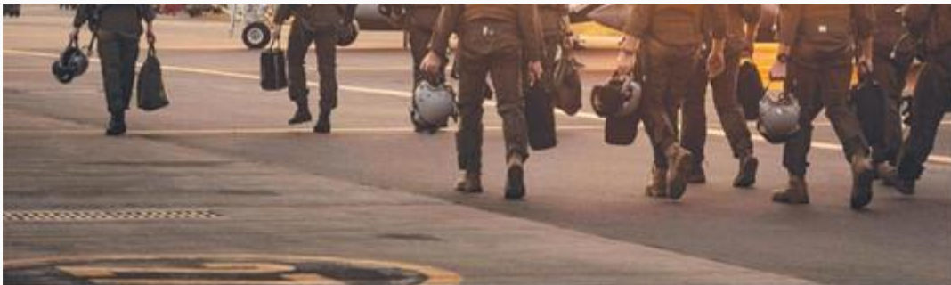
The federal government's investment plan will accelerate upgrades to RAAF Base Tindal; (below) Defence Industry Minister Pat Conroy, Solomon MP Luke Gosling and Assistant Defence Minister Matt Thistlethwaite in Darwin announcing $14bn-$18bn in funding over the next decade to bolster Australia's northern bases.