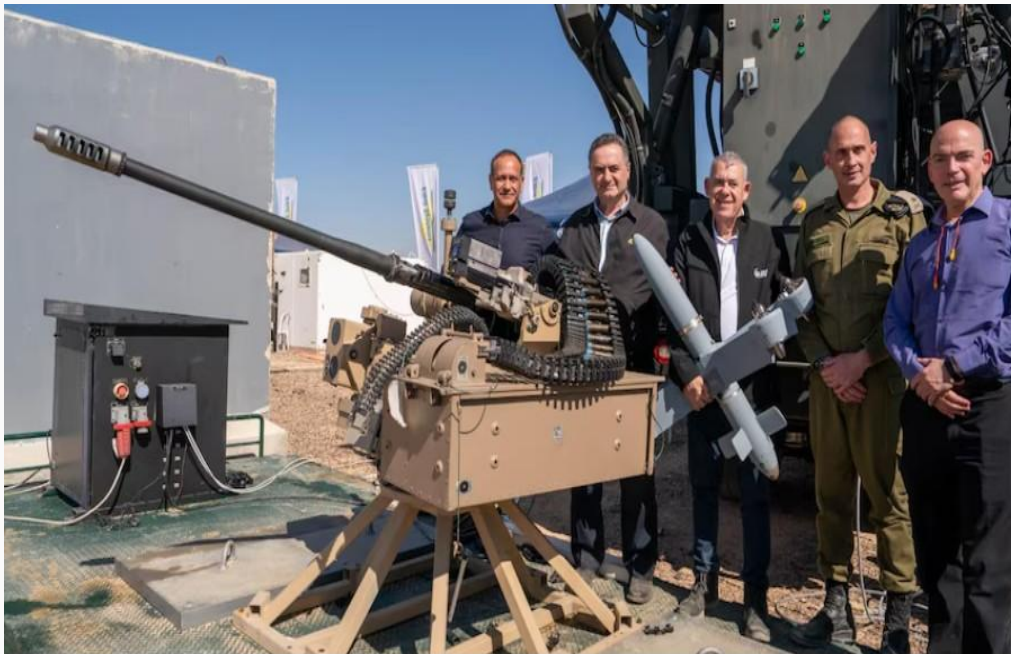
Israeli defence officials pose with an EOS Remote Weapon System in January