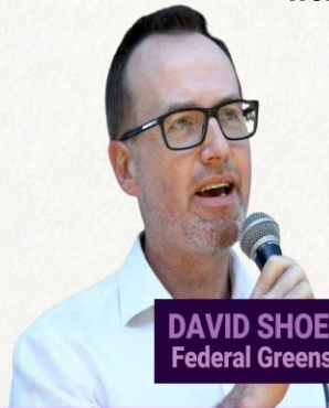
DAVID SHOEBRIDGE Federal Greens Senator

Join us to unpack the true stakes of AUKUS for Australia, as we discuss massive military investments and the controversial sell-off of historic public land to help foot the bill.