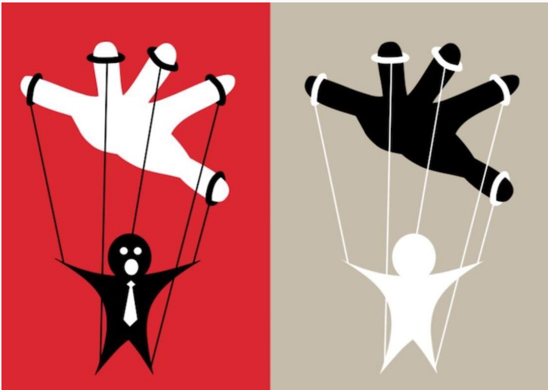
Agents of influence

Agents of influence, presumably Chinese, are in the news. But the really important agents of influence are organisations linked “hip to hip” to the US and its military/industrial complex. One of these is the Australian Strategic Policy Institute which is an enthusiastic supporter of almost all things American. It pretends it is an independent think