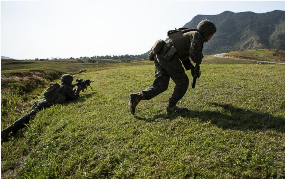
US marines in exercise capturing an island near Japan

Alex Lockie of the Business Insider (29/1/19) says: The U.S. Marine Corps is developing a new concept of naval warfare to allow Marines to take South China Sea islands from Beijing in the context of a massive missile fight in the Pacific.