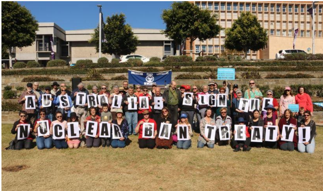
Hunter Peace group- Hiroshima Day 2017

The City of Newcastle joins the following Australian cities which have already joined ICAN's 'Save our Cities' campaign: Bayside (Vic), Blue Mountains (NSW), Darebin (Vic) Fremantle (WA) , Inner West (NSW), Melbourne (Vic), Moreland (Vic), Randwick (NSW), Woollongong (NSW), Sydney (NSW), Yarra (Vic), Yarra Ranges (Vic).