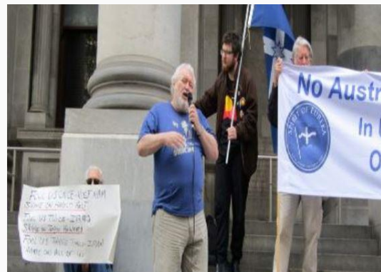
IPAN (SA)'s IDP Rally in Adelaide 22nd September, 2019