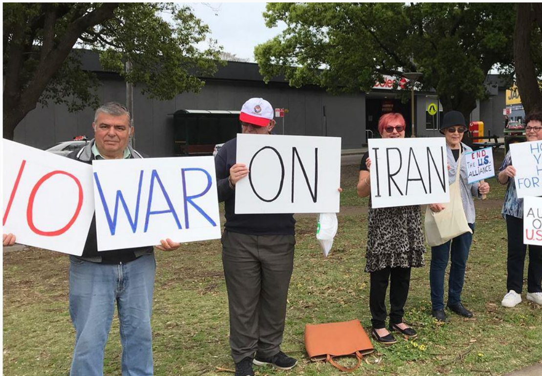
IPAN (Newcastle) "No War On Iran" vigil on IDP, 21st September