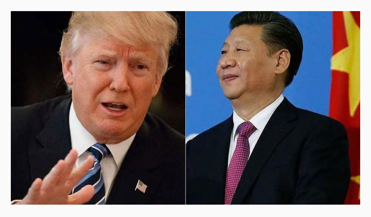
China to share all its information on Corona Virus with the United States