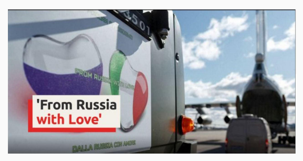
דוופ העסטומוז מוזוז שפעמוז וועוווען ווופעוניםו וופוף נט ונמוע נט שמנוופ כיטיש-19, a goodwill gesture labeled 'From Russia with Love'.

arrived in Italy to help stop the spread of the coronavirus in the Lombardy region.