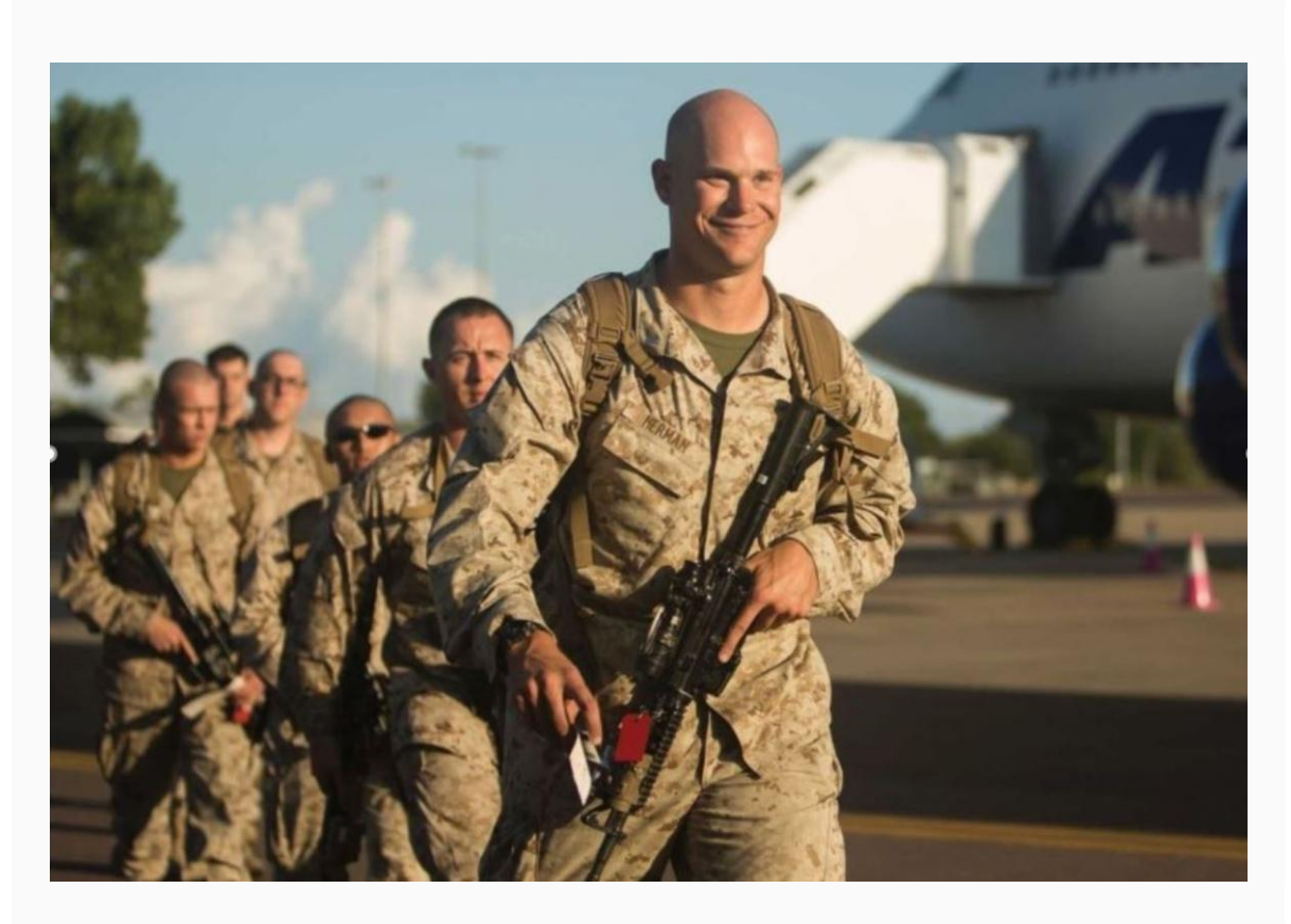
NOT ANY YEAR