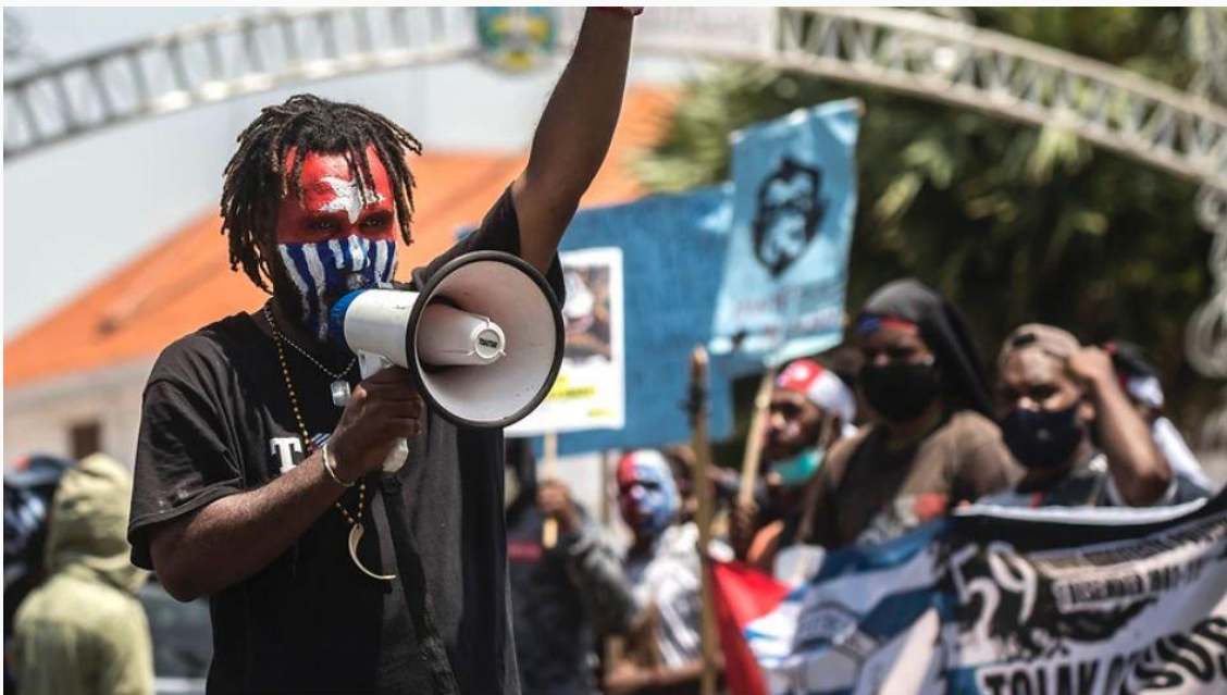
Hundreds of Papuans held rallies across at least eight cities in Indonesia on Tuesday to renew calls for independence.

More than 75% of all Labor, Coalition and Greens voters believe that Parliamentary approval should be required before Australian troops are deployed. Overall support for Parliamentary approval being required has jumped more than 6% since the last poll was undertaken in 2014.