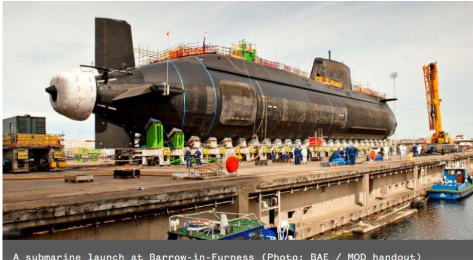
A submarine launch at Barrow-in-Furness

With acknowledgement to Declassified UK, 18th January 2022