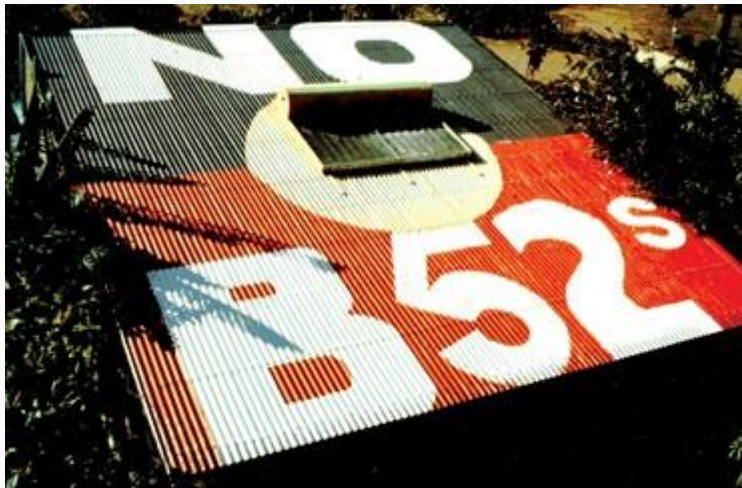
Roof top protest in Darwin in 1980's

With acknowledgement to Pearls & Irritations, 25th Oct., '22