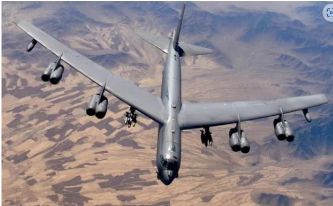
📷 A US air force B-52 bomber. Tindal airbase in Australia's Northern Territory will be able to host up to six of the nuclear-capable aircraft, officials have confirmed.

With acknowledgement to P & I, Nov 5, 2022