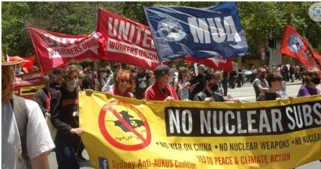
Sydney Anti-AUKUS Coalition protest supported by trade unions: "No Nuclear Submarines"