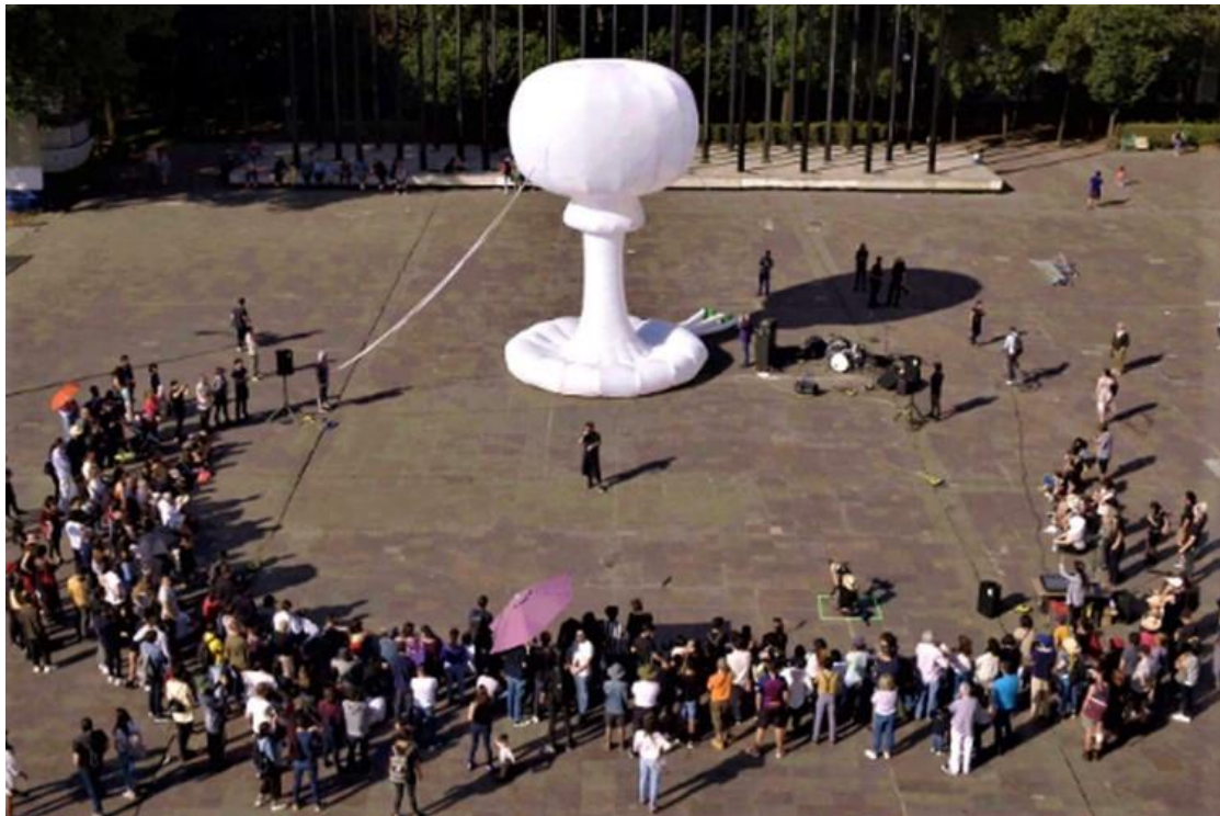
Amnesia Atomica, Pedro Reyes' three-storey inflatable mushroom cloud