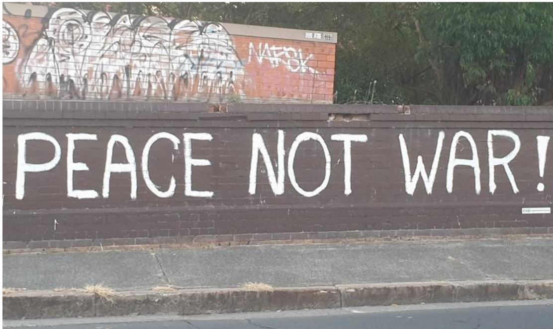
"PEACE NOT WAR !" "shouts" the paint up opposite the entrance to the Marrickville Railway Station