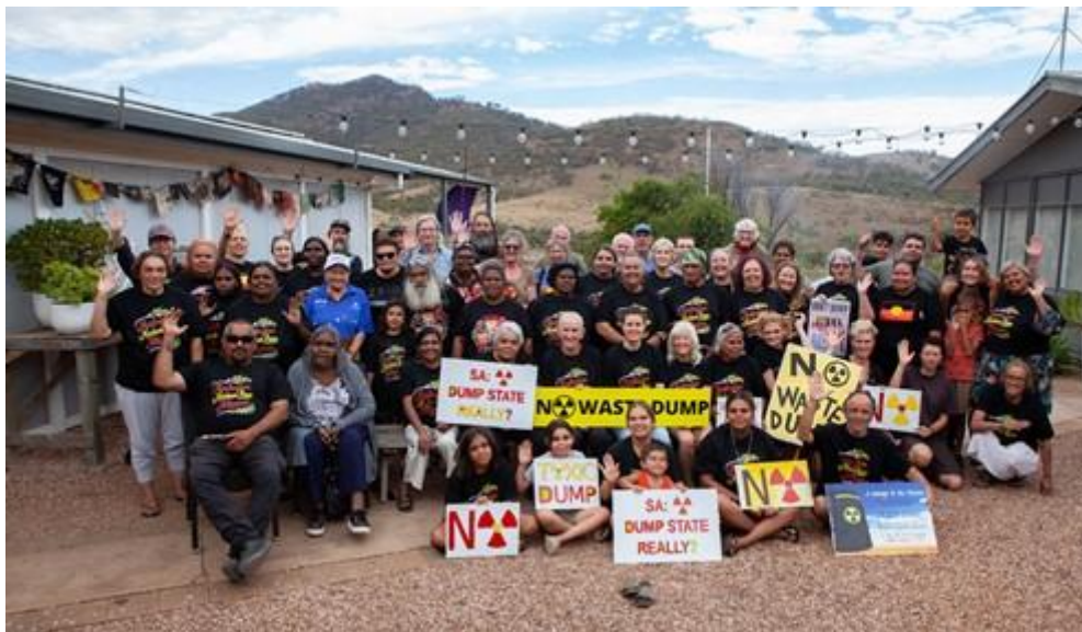
WA Nuclear Free Alliance supporting the Australian Nuclear free Alliance at their meeting at Quorn