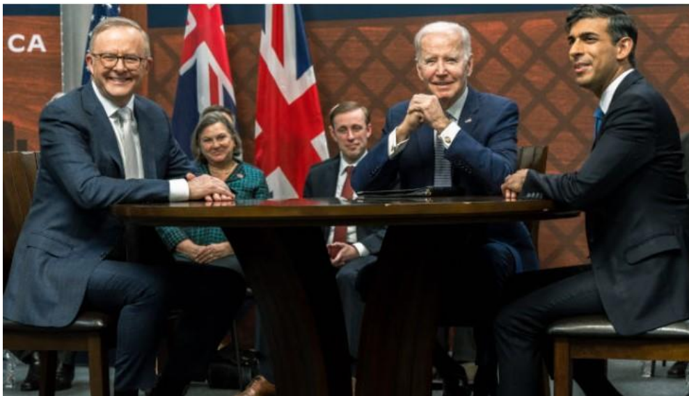
The AUKUS "Gang of three"