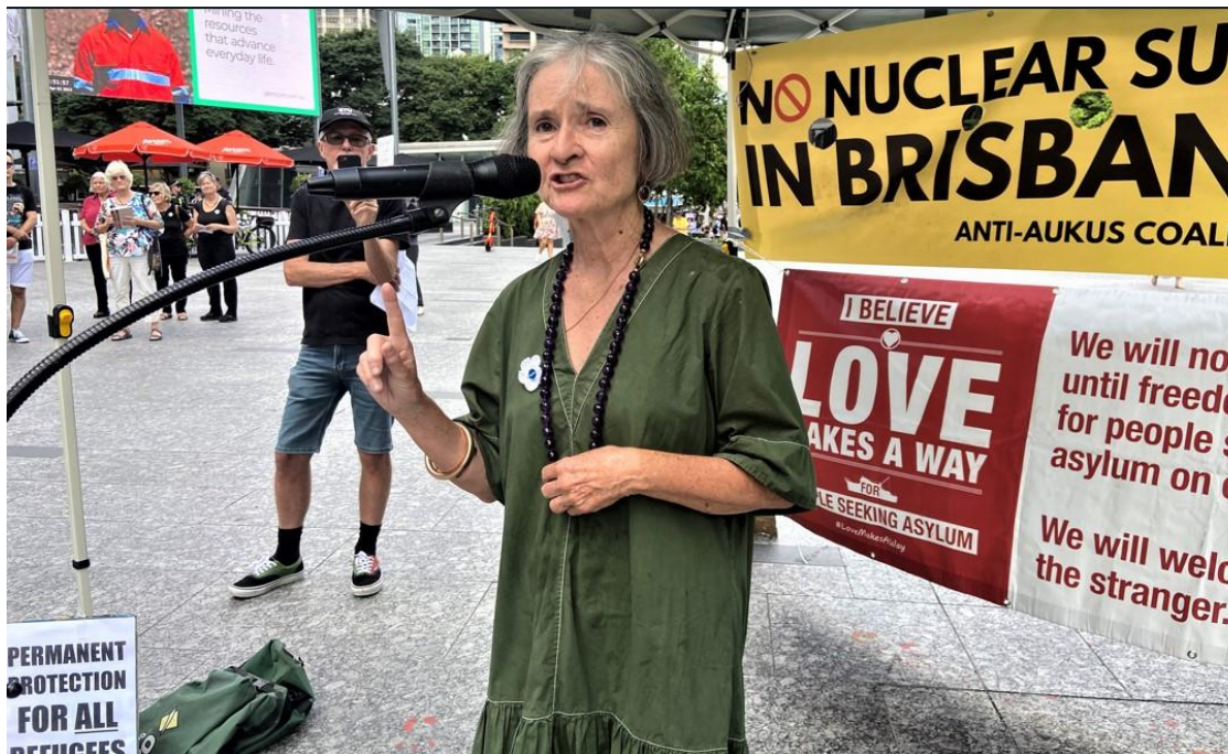
Palm Sunday in Brisbane